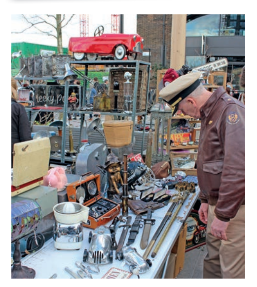
Hand-picked traders sold everything from vintage vinyl to homeware, jewellery and collectables. As one trader put it: "Just cool stuff in general!"