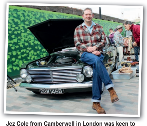
show off the powerplant inside his 1964 Vauxhall PB Cresta. Gone is the original 2651cc overheadvalve six-pot and in its place it now has a 353 cubic-inch Chevrolet small block V8, with an Edelbrock Performer manifold and Holley 650 carburettor. Performance is rated at 375bhp and it's quicker from 0-60mph than a Ford Sierra Cosworth.

WH: "What we'd like to do here is completely populate every single like to turn this into something with 500 cars here, maybe even 1000 cars – why can't this be as big an event as Goodwood? There's no reason for it not to be."